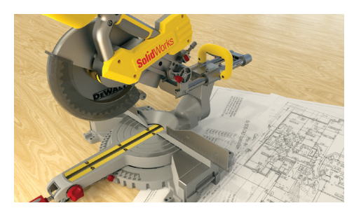
Bunkspeed integrates into SolidWorks for a seamless workflow.

You already know how valuable eDrawings can be for sharing native SolidWorks files for design or marketing reviews. However, you may not know that this popular SolidWorks add-in also works in 3D! This provides tremendous opportunities for displaying extreme detail in stereoscopic 3D to really give your customers and managers the truest representation of your design.